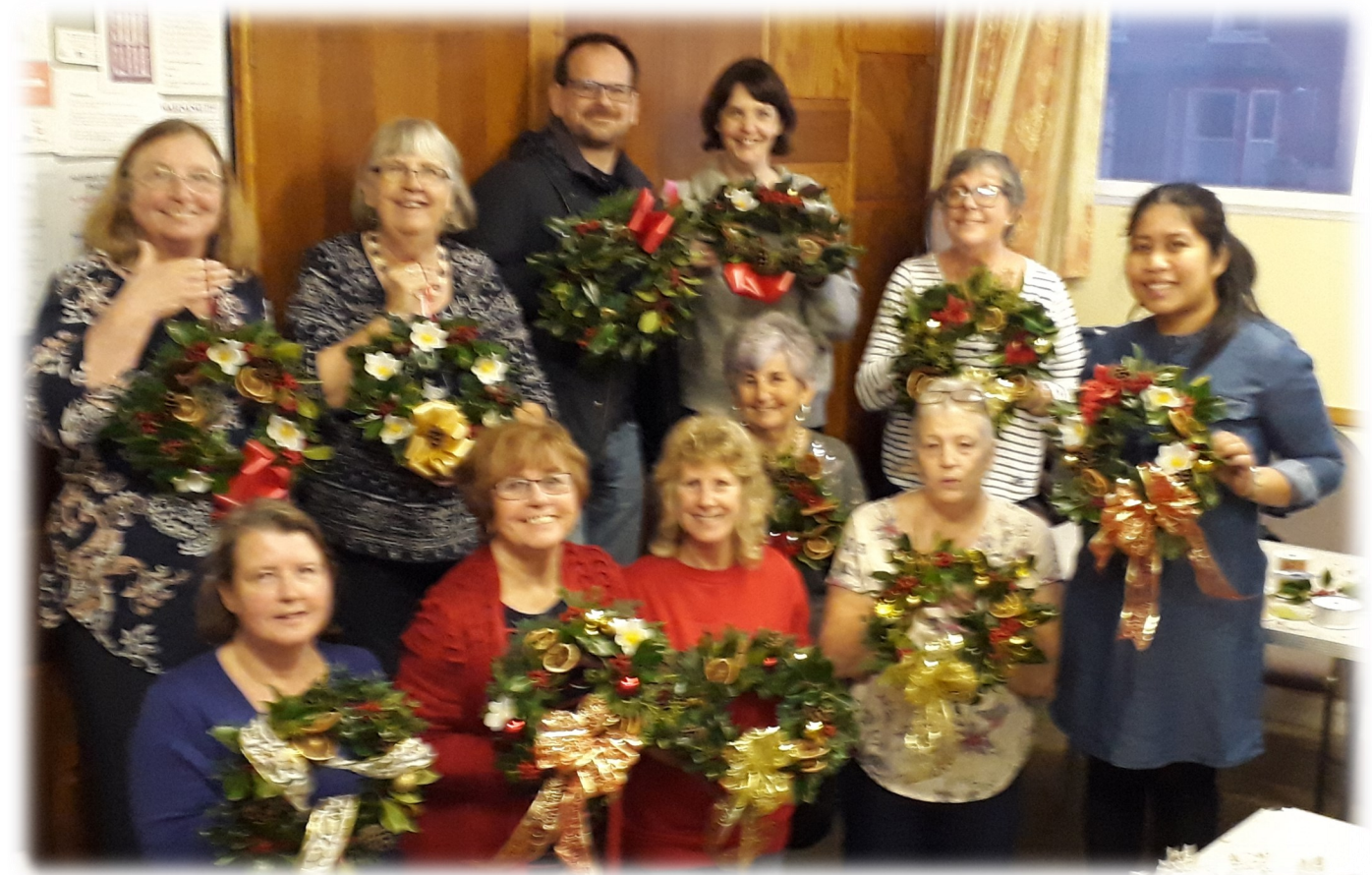
Much-loved faces from 2018

Wreath-making Wednesday November 19th starting at 11:20 This will go on probably for not less than two hours, so do bring a packed lunch if you'd like to.